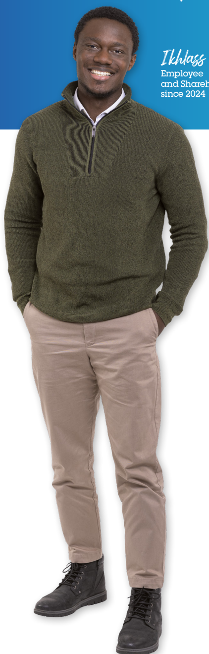
Ikhlass Employee and Shareholder since 2024

December 9, 2025 Capital increase and creation of your shares